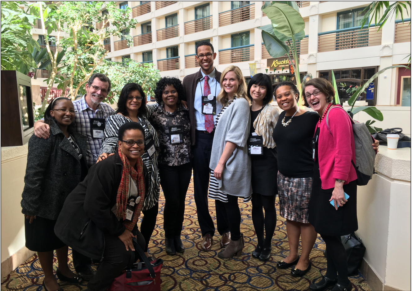
POD Diversity Committee Members and Friends 2015

Louisville, Kentucky November 9-13, 2016